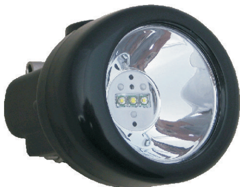
Ex ia I IP67

The version 3 of KC3E-Ex is our flagship model. It is the brightest in our Cordless Miner's Caplamp Series and is charged through external electrodes. The new version of KC3E-Ex has three LEDs. The Main LED, in the middle of the reflector, is used for both normal and high-beam illumination. The two Emergency LEDs, located on each side of the Main LED, operate for extended periods of time during an emergency.